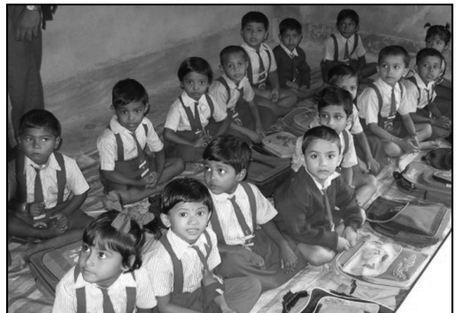
Children in their classroom at Project Five-O in Kolkata.

The trip was truly a kaleidoscope of colors, sounds, tastes, sights, and indelible memories. Memories of places and the outstanding people we met along the way -- of friendships made and experiences shared. Our collective thanks go to all the people that touched us in so many ways and across so many miles. It truly did bring us together as one spirit and more committed than ever to pursue the mission of VGIF to help empower women and girls in developing countries.