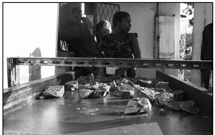
A vocational student examining the soap she has just made.

90 teen and young mothers have been trained in the income-generating skills of soap and bread making. These products are in high demand in the DRC but must be imported from neighboring Rwanda and Burundi. In addition to community support, the head of Uvira territory personally donated 100 USD to print certificates of completion for the trainees, validating their accomplishments. The project has been so successful that additional training is planned for 97 more young mothers in January. The young women are now able to send their children to school and contribute to medical health expenses for themselves and their families. A portion of the monies loaned to the participants will be paid back, providing project sustainability for the next group of trainees.