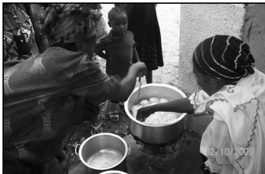
Food preparation class at the Vocational Training Center for Youth in Distress in the DRC [#4079 previous page]

After one month’s training, 50 Traditional Birth Attendants (TBAs) gained a basic functional foundation of pre- and post-natal care in addition to access to delivery kits needed to improve the lives of mothers and babies in three remote islands in southern Bangladesh. Training was given to identify risky pregnancies that should be referred to hospitals for safe delivery. Iron and folic acid tablets are being distributed to pregnant women, improving the mothers’ health and enabling the TBAs to be welcomed into the communities they are serving. TBAs submit monthly reports to an LHD supervisor who monitors and evaluates their activities and sets the schedule for subsequent months. This project continues to have a significant impact on health care in rural Bangladesh.