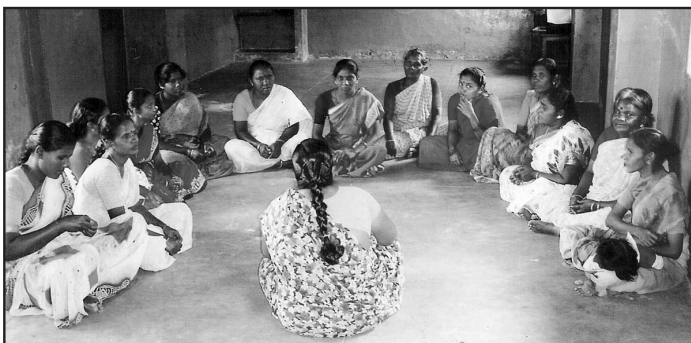
Disadvantaged women receive training in footwear production and marketing in MADurai, India.

This project targeted 100 disadvantaged women of the cobbler community in Madurai through training in the production of footwear and assisted them in marketing the products to local cooperatives and showrooms. In addition, books and reading and writing materials were distributed to 67 cobbler community children. Funds were used for skill-training expenses, purchase of raw materials, and educational support for the children.