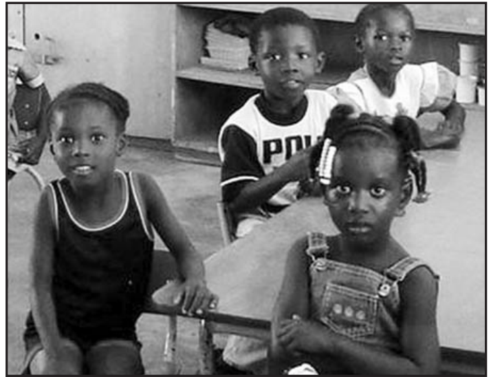
Children in Suriname are taught Dutch to stimulate their language development.

An integrated fish farm project educated a total of 250 women on the nutritional value of fish. It also provided for the construction of two fishponds stocked with fingerlings, and purchased nets and a refrigeration/storage container. Participant comments described the positive benefits of the project as income-generation for the members, improved food security for the community, and increased employment possibilities. Funds from VGIF were used to purchase construction materials, five nets, a refrigerator, two donkeys, and provide two training workshops.