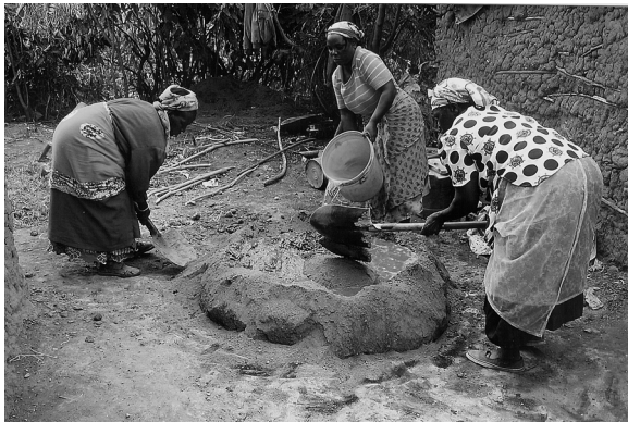
#2237 Women mixing cement in Kenya.

This project is located in a rural area of the Rift Valley. They reported the completion of 9 out of the 20 proposed ferro-cement water tanks ensuring safe and accessible water for bathing, drinking, and cooking for community women and their families. Since the start of construction, at least seven other women's groups in the area have expressed interest in also constructing ferro-cement tanks.