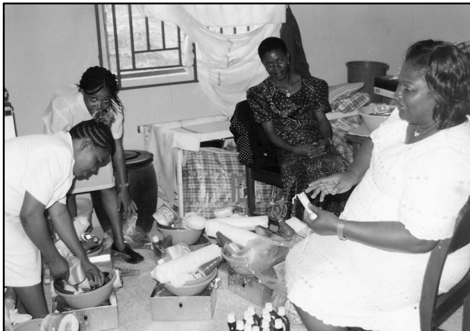
#2487 In Nigeria, Traditional Birth Attendants prepare mid-wifery kits to improve obstetrical health care of rural women.

The VG Flash -- New!! Project Grants Library and Photos Available Recruitment Materials Committee Reports .. and much more