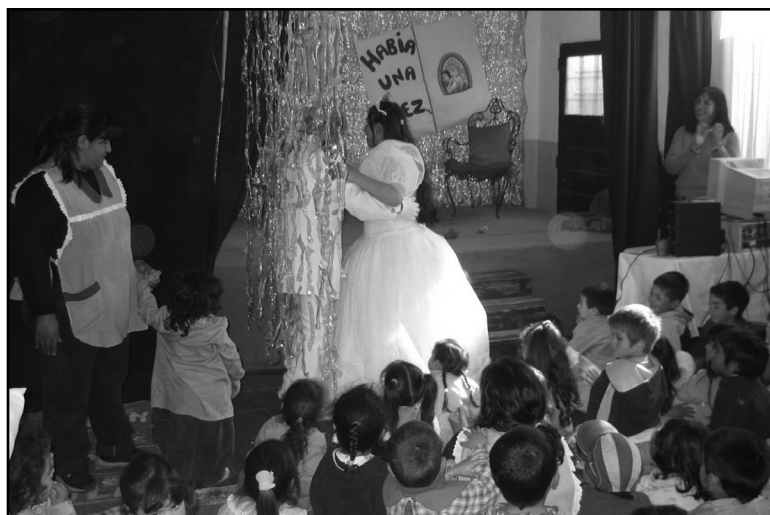
#2606, C.I.E.L.O., South America: Children enjoy watching a performance of Cinderella at a toy library.